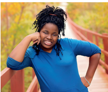
Autumn C07620, age 17